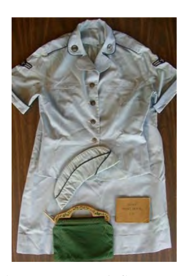
U. S. Air Force Women's Summer Uniform, War Song Book 1918, Handmade knitting bag for Grange Contest